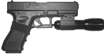
The TH10 with M2 on Glock 17