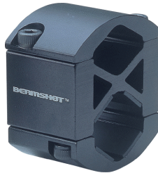
UB2-Universal Barrel Mount