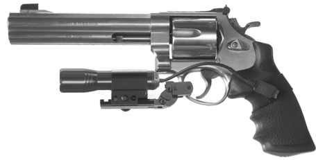
The TH10 with M2 and UT1 on revolver