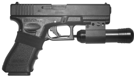
The T804 with M2 on Glock 17