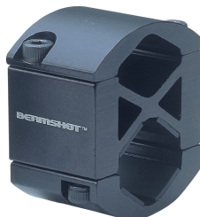
UB2-Universal Barrel Mount