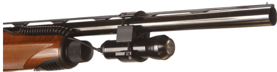
The T804 with UB2 on shotgun