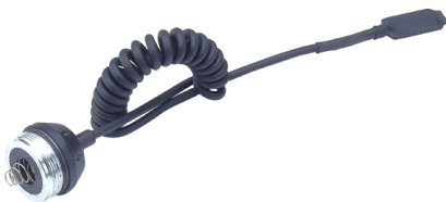
C5 Bungee Pressure Pad 30" Long Switch

All BEAMSHOT™ laser sights are shock tested to 2000G for 10 ms and have a one-year limited warranty.