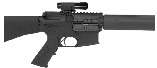
The T804 with M2 on rifle