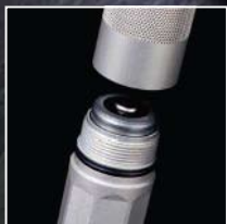
Anodized threads provide durability and protection from the elements.