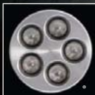
INOVA X5 Individual reflectors surround each of the five LED lamps recessed into the X5's patented stainless steel head.